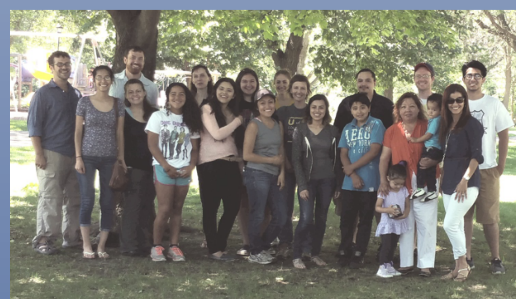
Medical, pharmacy, and undergraduate team from the University of Minnesota with our friends from the migrant advocacy organization Centro Campesino