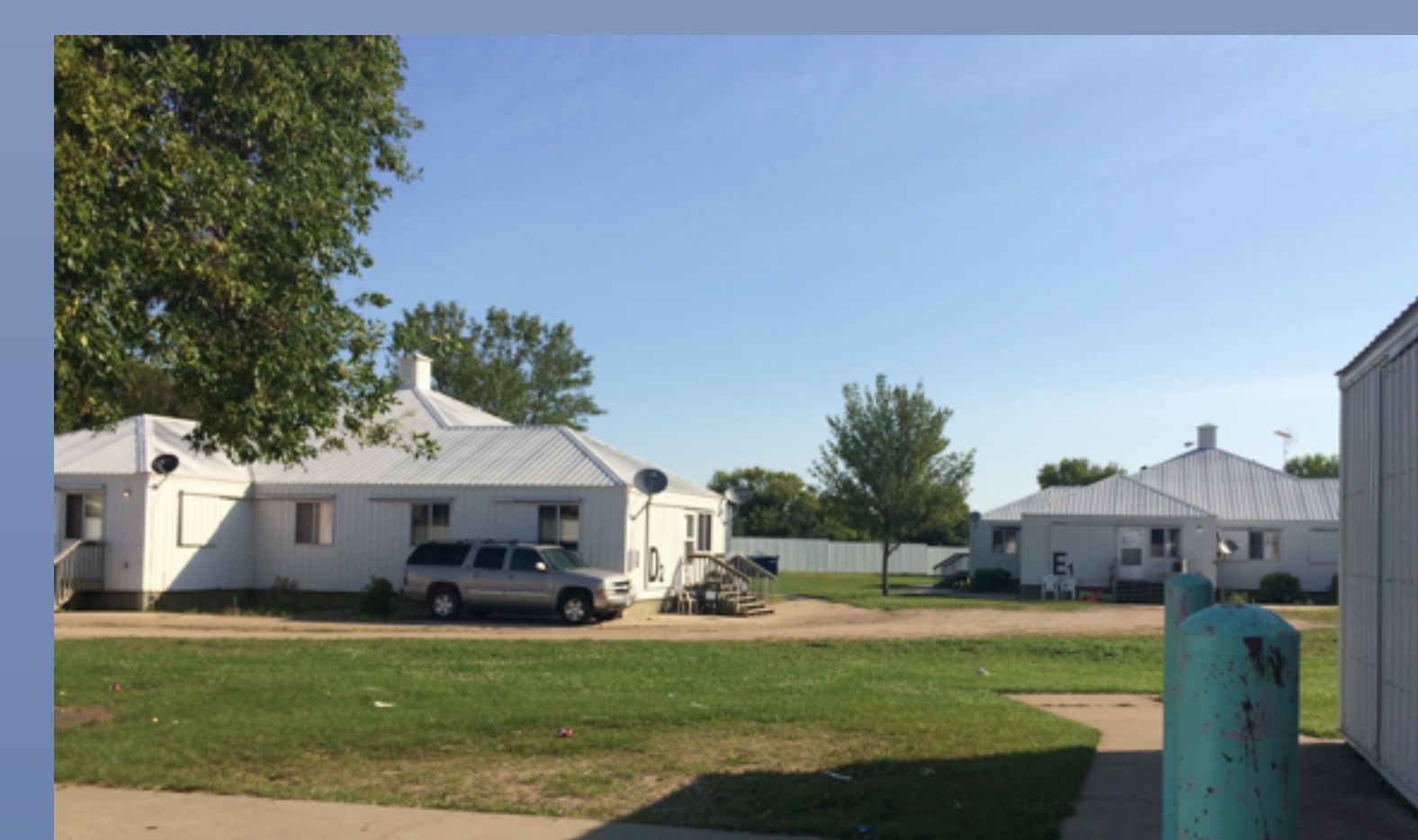
A migrant farmworker housing compound in Brooten, MN. Housing over 100 families, it was one site where the mobile medical unit was located.